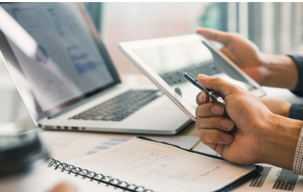
Corporations and financial services regulation