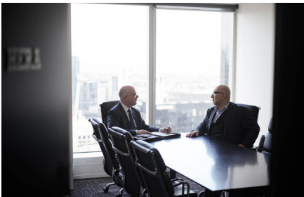
White collar and corporate crime