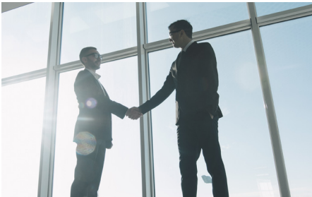
Office of State Revenue Compliance