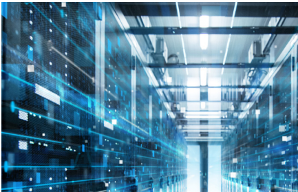
ASX regulatory compliance