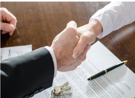
Wills and estates