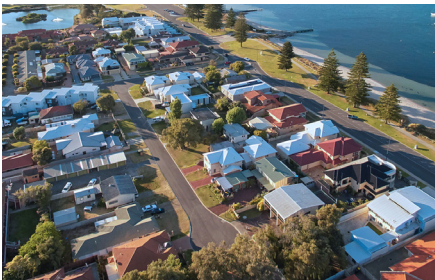
Formation and restructuring of entities