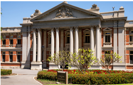
Asset acquisitions and disposals