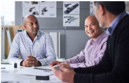
Corporate governance and directors' duties