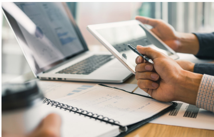
Mergers and acquisitions