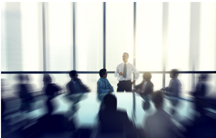
Capital raising and equity capital market transactions