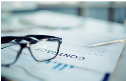
Preparation of commercial agreements