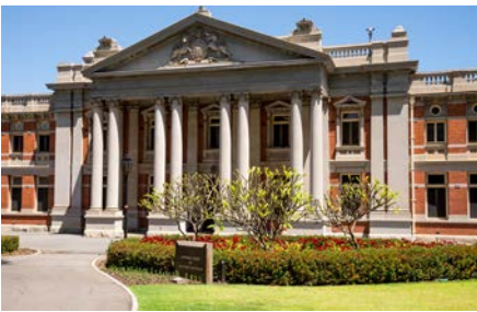
Commercial litigation and dispute resolution, including class actions