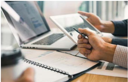
Deeds of company arrangement