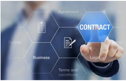
Regulation and investigations, including disclosures