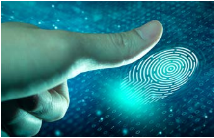
Reputation and defamation protection