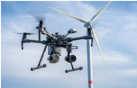
Aviation and drone regulatory issues