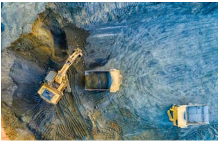
Employment and labour disputes