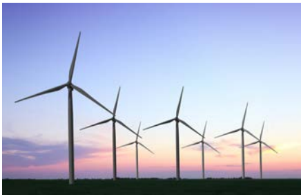
Environmental, Social and Governance risks and compliance