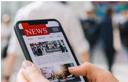
Defamatory posts on public forums