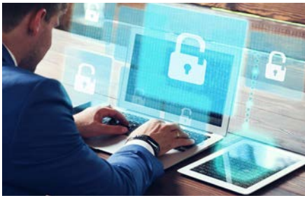
Information governance, privacy and cybersecurity