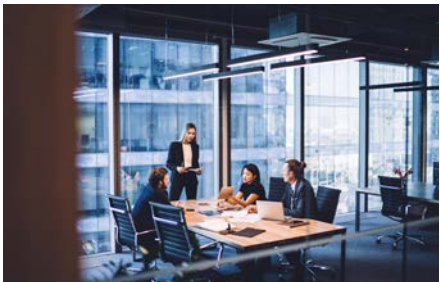
Mergers, acquisitions and takeovers