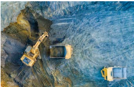
Employment and labour disputes