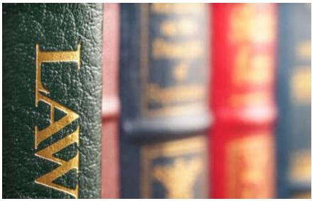
Modern slavery reporting and risk mitigation