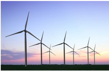
Environmental, Social and Governance risks and compliance