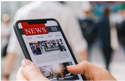
Defamatory posts on public forums