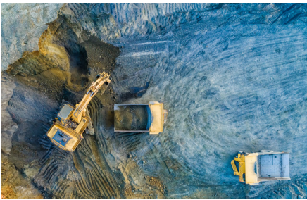
Employment and labour disputes