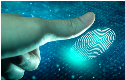
Reputation and defamation protection