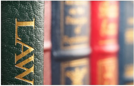
Modern slavery reporting and risk mitigation