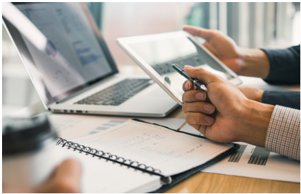
Deeds of company arrangement