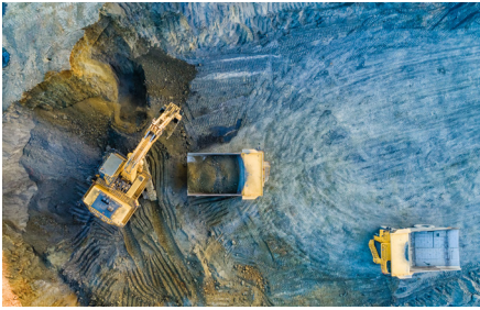
Employment and labour disputes