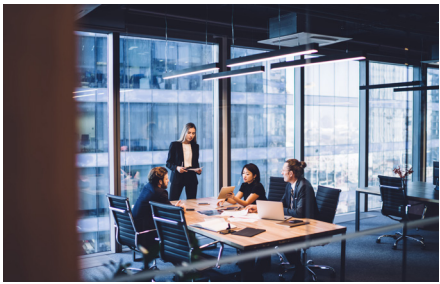
Mergers, acquisitions and takeovers