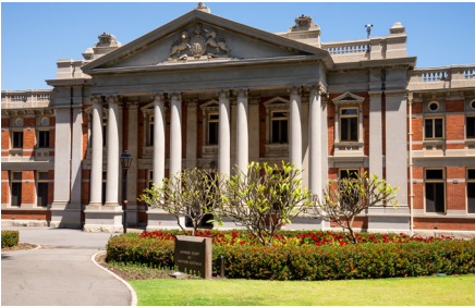
Commercial litigation and dispute resolution, including class actions