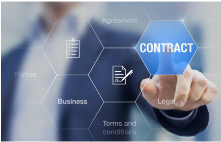
Regulation and investigations, including disclosures