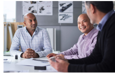
Corporate governance and directors' duties