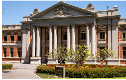
Asset acquisitions and disposals