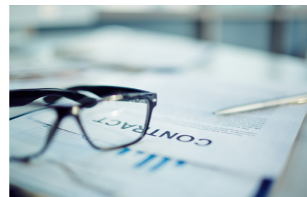
Preparation of commercial agreements