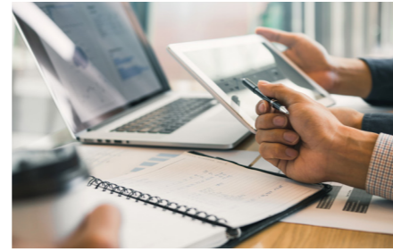
Mergers and acquisitions