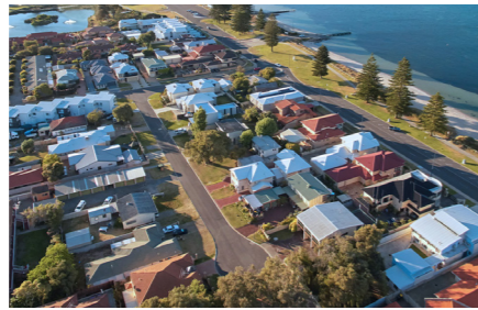
Formation and restructuring of entities