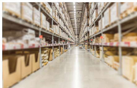
Procurement and supply chain issues