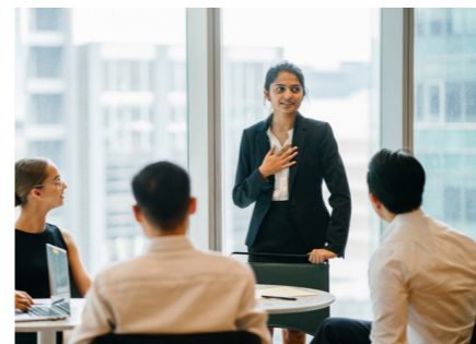
Employment, industrial relations and safety