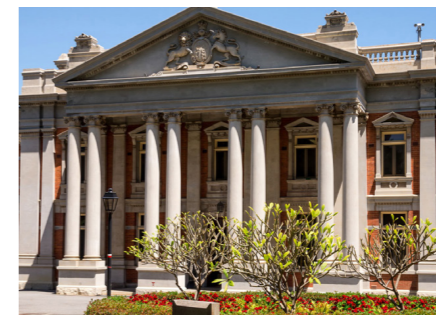
Commercial litigation and dispute resolution