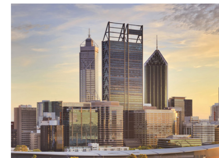
Corporate advisory and commercial