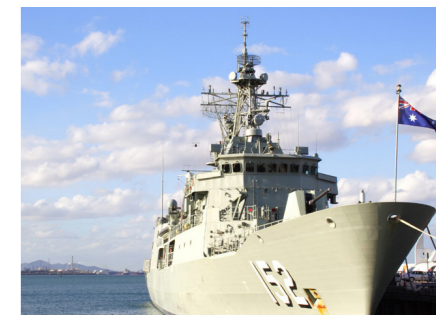
Maritime and defence contracting and law