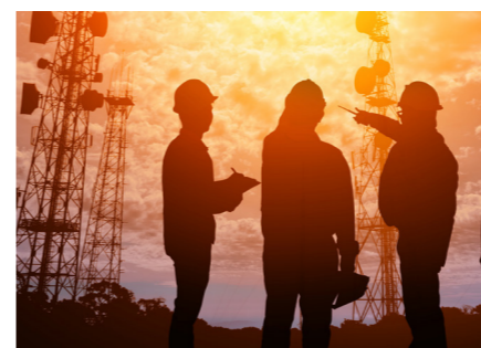
Projects, infrastructure and construction