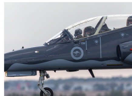
Aircraft and drone commercial and regulatory advice