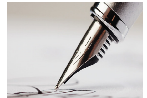
Intellectual property and licensing