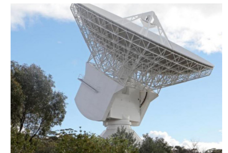
Property and leasing