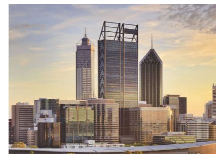
General corporate and commercial advice