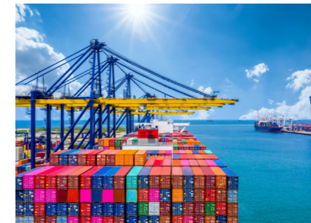
Engineering, construction and maritime contracting