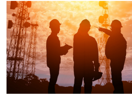
Construction contracts and disputes