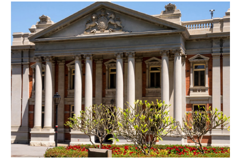
Commercial litigation and dispute resolution