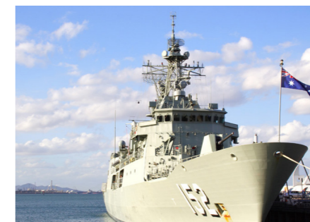
Maritime and defence contracting and law