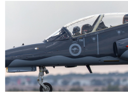
Aircraft and drone commercial and regulatory advice