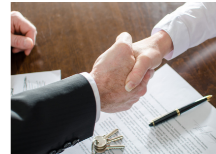
Wills and estates