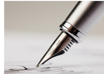
Intellectual property and licensing