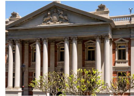
Litigation and dispute resolution

We are absolutely committed to ensuring you have the peace of mind you need to focus on your business productivity whilst we look after your legal issues.