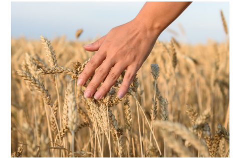
Property and leasing