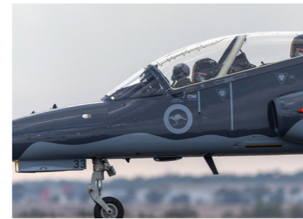
Aircraft and drone commercial and regulatory advice