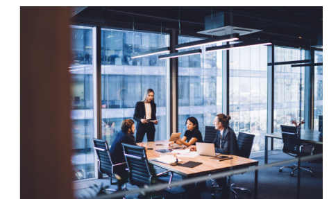
Mergers, acquisitions and takeovers