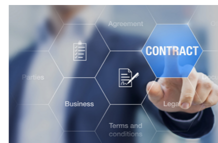
Regulation and investigations, including disclosures