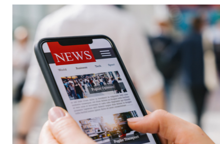
Defamatory posts on public forums