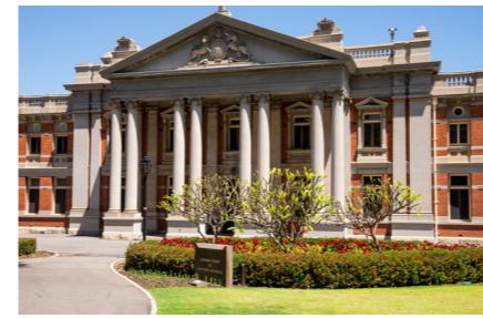
Commercial litigation and dispute resolution, including class actions