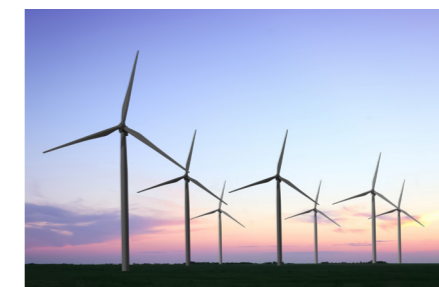
Environmental, Social and Governance risks and compliance