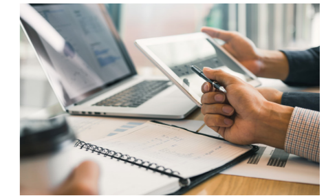
Deeds of company arrangement