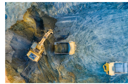
Employment and labour disputes